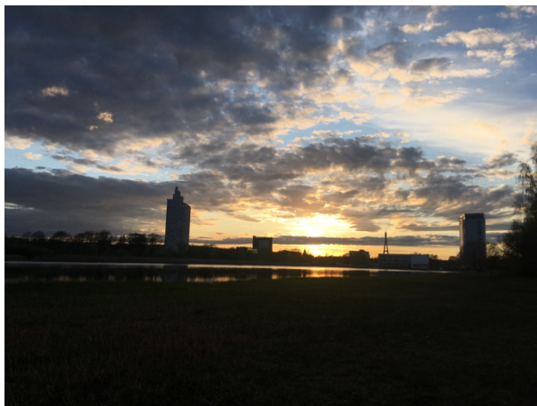
12. picture: Sunset in Tartu

All in all Tartu is a great city to live, study, meet with new people, to face new challenges, and to travel around a region which is not so well known in Central-Europe. I could recommend to taste this Baltic feeling of life with full of my heart.