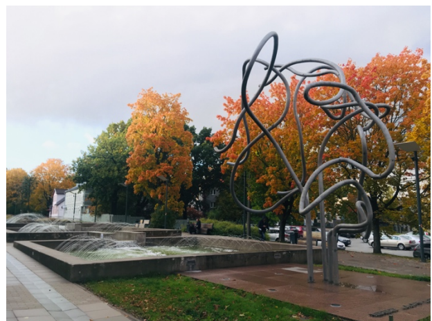
15. picture: Fountain in front of the library

If you are considering to choose Tartu as your Erasmus destination, do not hesitate to contact me via e-mail: szekely.anna.95@com .