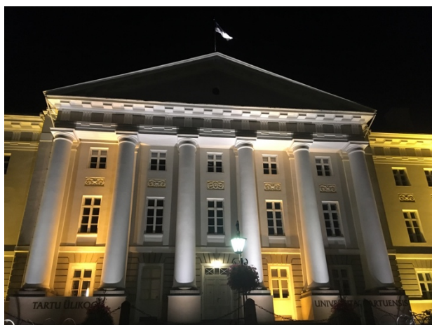
14. picture: Main building of the University