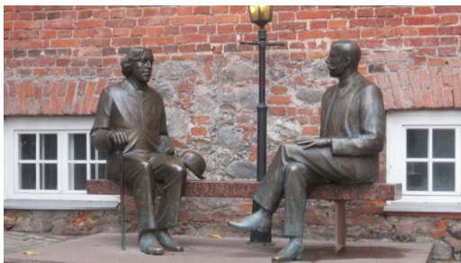
1. picture: Sculpture of Oscar Wilde and Eduard Vilde

Tartu is a small city but full of attraction. There are numerous museums, like the Estonian National Museum, Toy museum, Beer Museum or Art Museum – just naming a few. But you can also have fun in the Upside-down house, explore the interactive Science Center, take a walk in the Botanic Garden, or visit the Theatre, Vanemuine . Culture is all around of Tartu; what could be a better proof for it than the fact that Tartu is going to be the European Capital of Culture in 2024? The culture-rich atmosphere of the city is not only sensible by the high number of cultural institutes but the sculptures which are all around in the central part of the city.