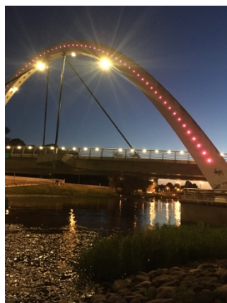
10. picture: Bridge close to Delta building