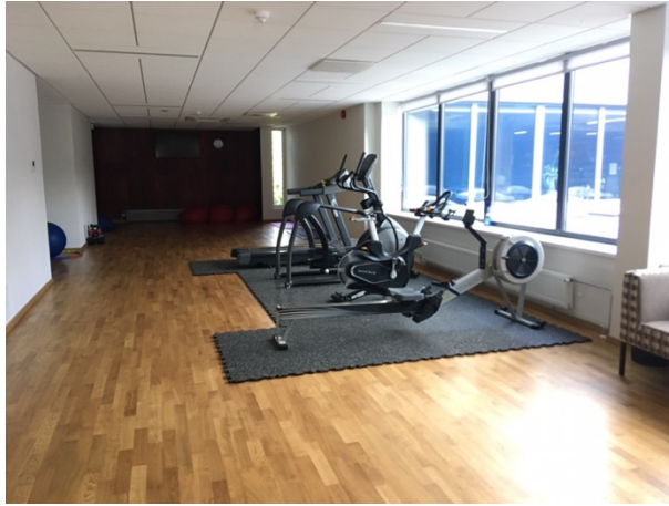
6. picture: Recreation room of the public library

The high level of student services not only apparent in the environment of Delta building, further amazing student services are the recreation room of the library which is free of charge for all the visitors, or the very cheap student access for the gym.