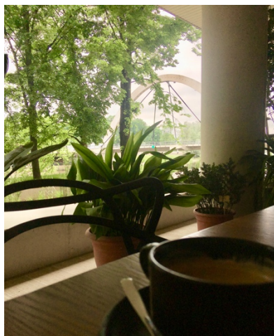
5. picture: Scene from the terrace of Delta cafe

Speaking about the University, it is also worth to note, that the university just opened a new campus, called Delta, with all the comfort and the technical support what a student can expect. Furthermore, the building has a perfect view to the city's river, Emajõgi, and one can conveniently write their assignments sitting on the beanbag or in a huge armchair when getting inspired by the scene of the river and the city. After finishing the day in Delta, students can just getting out from the building and enjoy the sun and social life at the river bank, right next to the building.