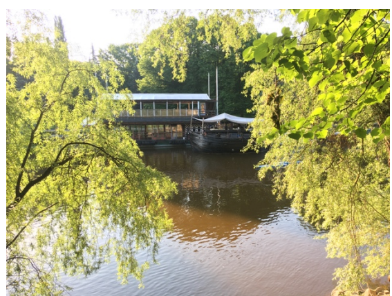
11. picture: Ship on the Emajõgi