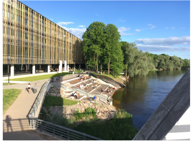
7. picture: The students and citizens enjoy the sun in front of the Delta building

The city's river, Emajõgi shapes Tartu's landscape directly. It crosses the center of the city and inspired numerous bridges, most of which is exclusively for pedestrians. However, Tartu's close relationship with the nature doesn't come only from the relationship with the river, and the way how the citizens use it (for kayaking, swimming, sunbath at the river bank, etc). Tartu is a very green city with numerous parks, and lots of trees.