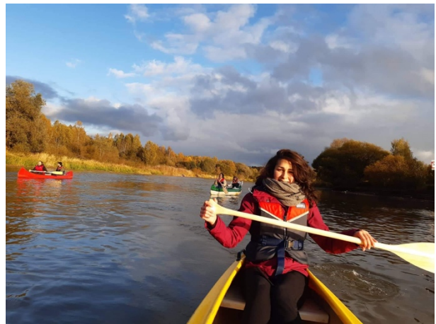
13. picture: Kayaking on the Emajõgi river