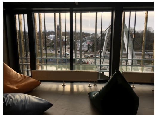
4. picture: beanbags and scene from Delta building

The high quality of education is palpable during the 16 weeks long education period, when most of the courses requires weekly preparation, intellectual commitment and contribution to the seminar discussions. The courses don't require the memorization of lexical knowledge but thinking and solving challenges which connected to real life problems. This approach provides a much useable knowledge and builds better skills than most of the Hungarian higher education programs do. The lecturers are well prepared and helpful, however they expect a lot from their students.