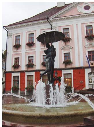
2. picture: Kissing Students statue at the town hall