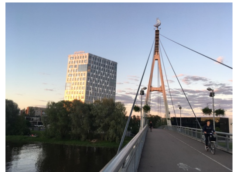
8. picture: Turusild – Market Bridge

The city's river, Emajõgi shapes Tartu's landscape directly. It crosses the center of the city and inspired numerous bridges, most of which is exclusively for pedestrians. However, Tartu's close relationship with the nature doesn't come only from the relationship with the river, and the way how the citizens use it (for kayaking, swimming, sunbath at the river bank, etc). Tartu is a very green city with numerous parks, and lots of trees.