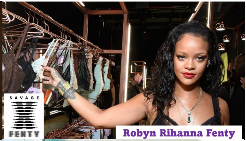
Robyn Rihanna Fenty