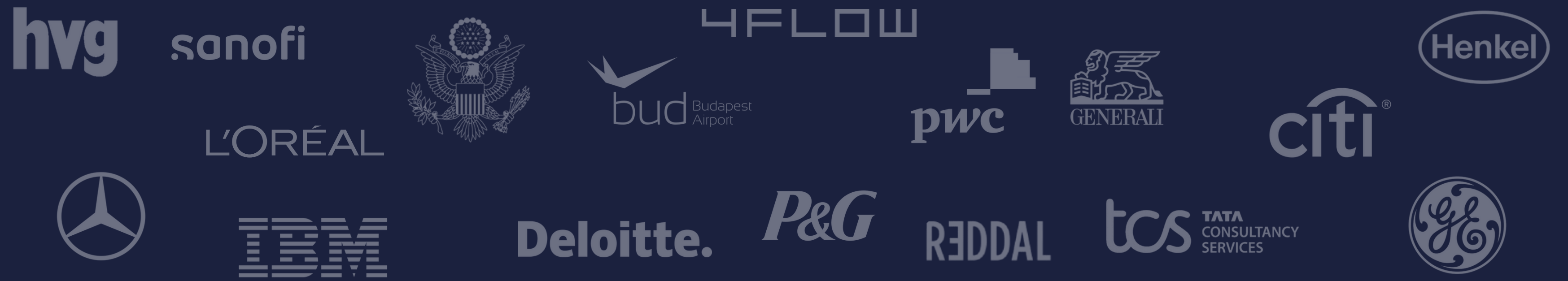
Logos of some of the exhibitors from previous years